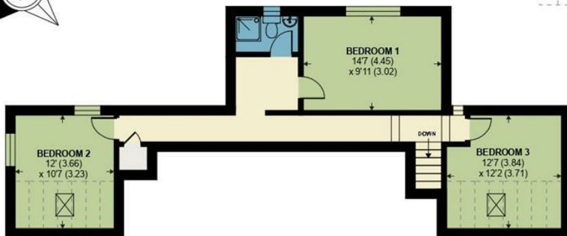
THE BARN FIRST FLOOR